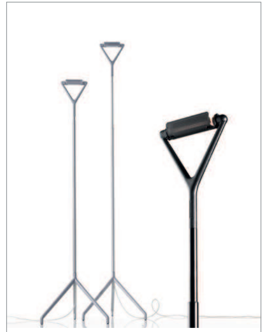
D15 d. (foot dimmer)

Reference code: Structure 1D15=1D00020 alu 1D15=1D00017 black